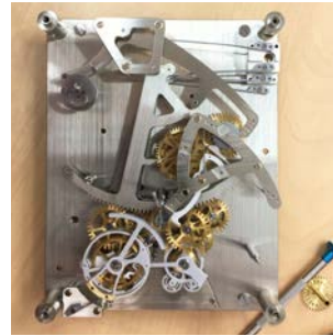
Moscow Computus Clock, analemma and tourbillon dials.